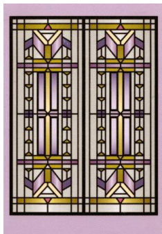
Frank Lloyd Wright